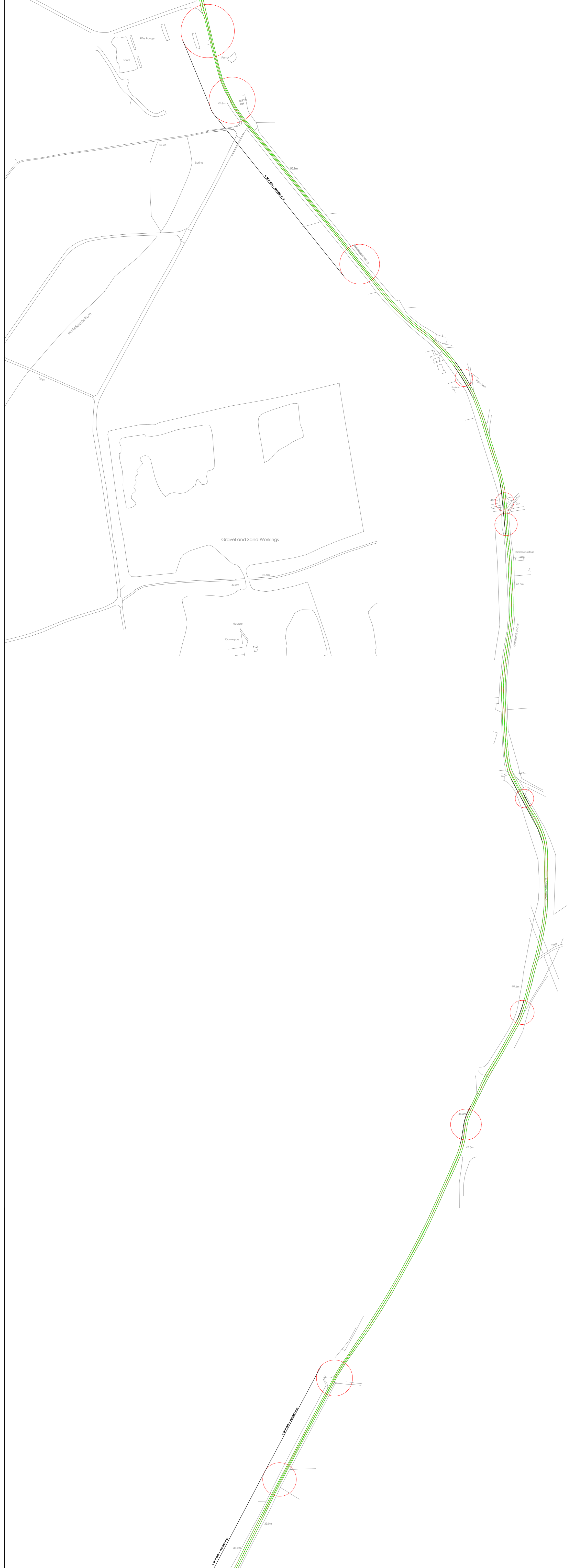
VEHICLE TRACKING OVERVIEW OF ROUTE TO ALDERHOLT SOUTH ALONG HARBRIDGE DRIVE, NORTHERN PART (SCALE: 1:3000)