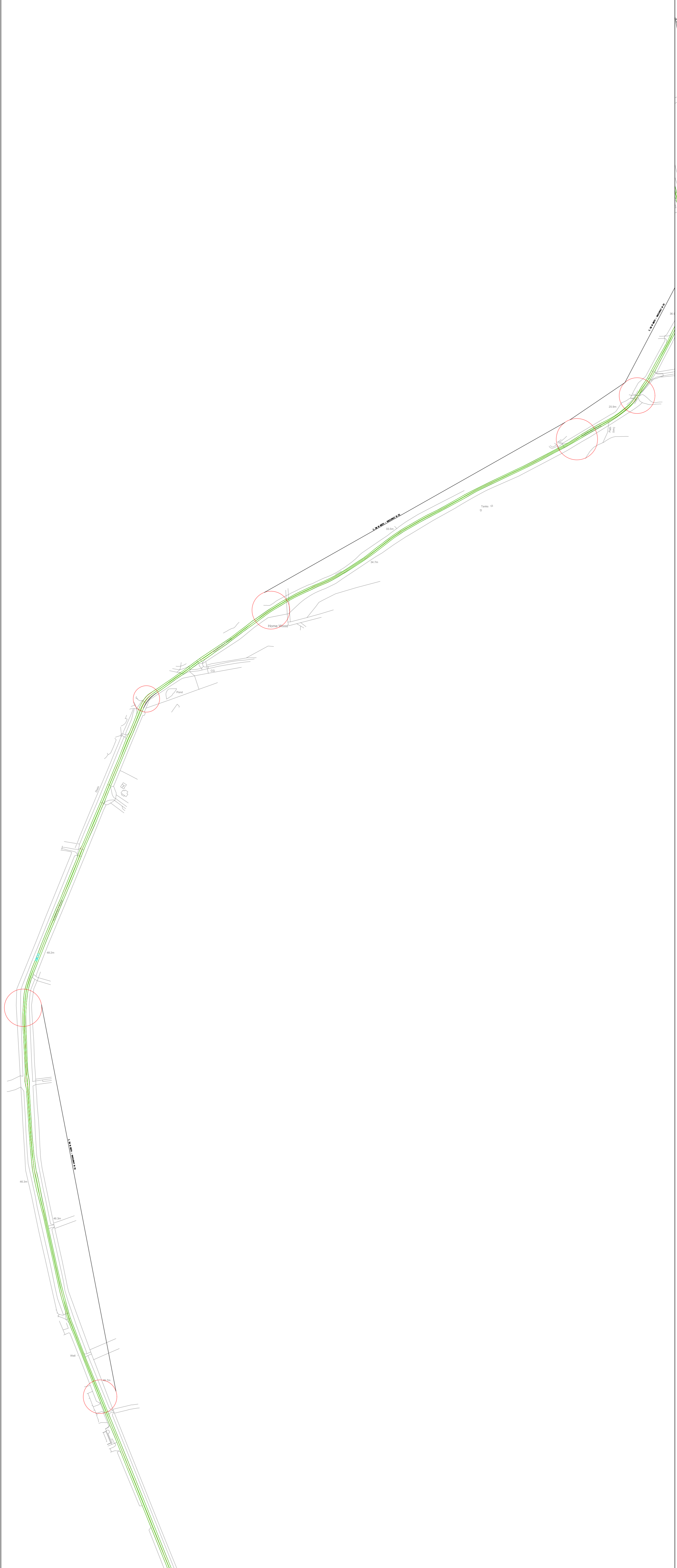
VEHICLE TRACKING OVERVIEW OF ROUTE TO ALDERHOLT SOUTH ALONG HARBRIDGE DRIVE, MIDDLE PART (SCALE: 1:3000)